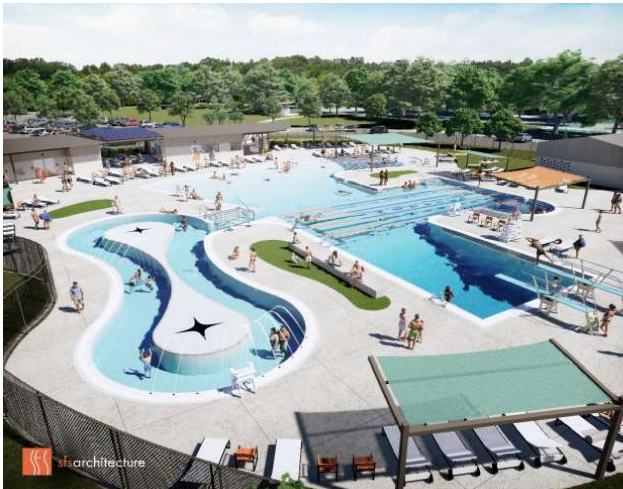
Figure 1 Rendering of Birdseye view of reconstructed pool.