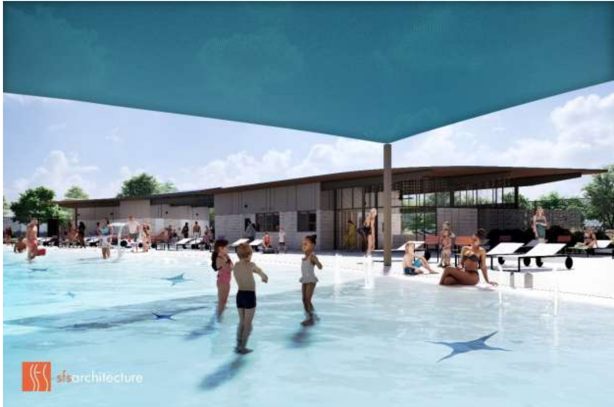
Figure 6 Architect rendering of the zero-depth area of the pool