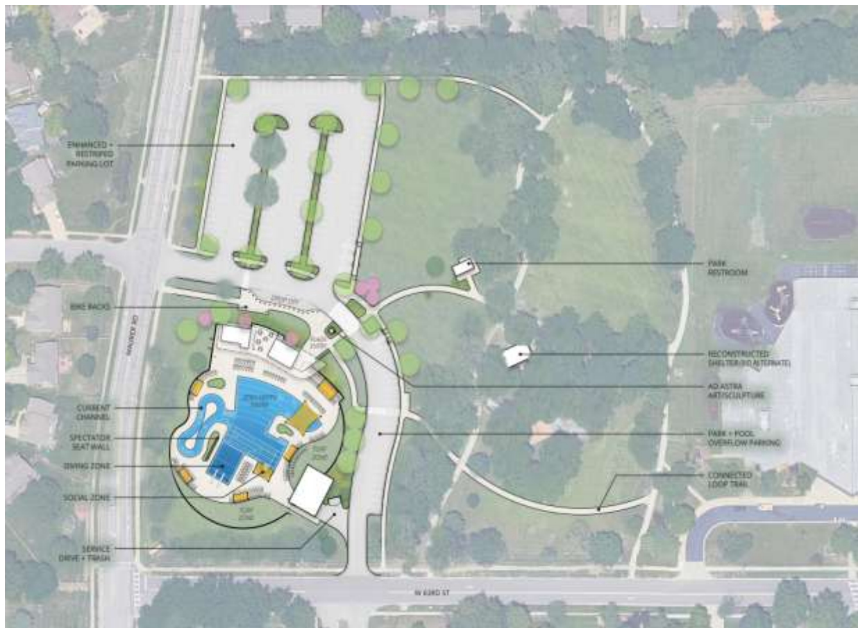
Figure 3 Rendering showing the proposed site improvements.