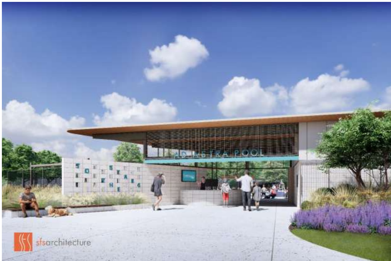
Figure 2 Rendering of renovated facility showing pool entrance.

Recognizing the opportunity to integrate public art into this highly visible and well-loved community destination, the Lenexa Arts Council has designated Ad Astra as a top-priority location for 2025 .