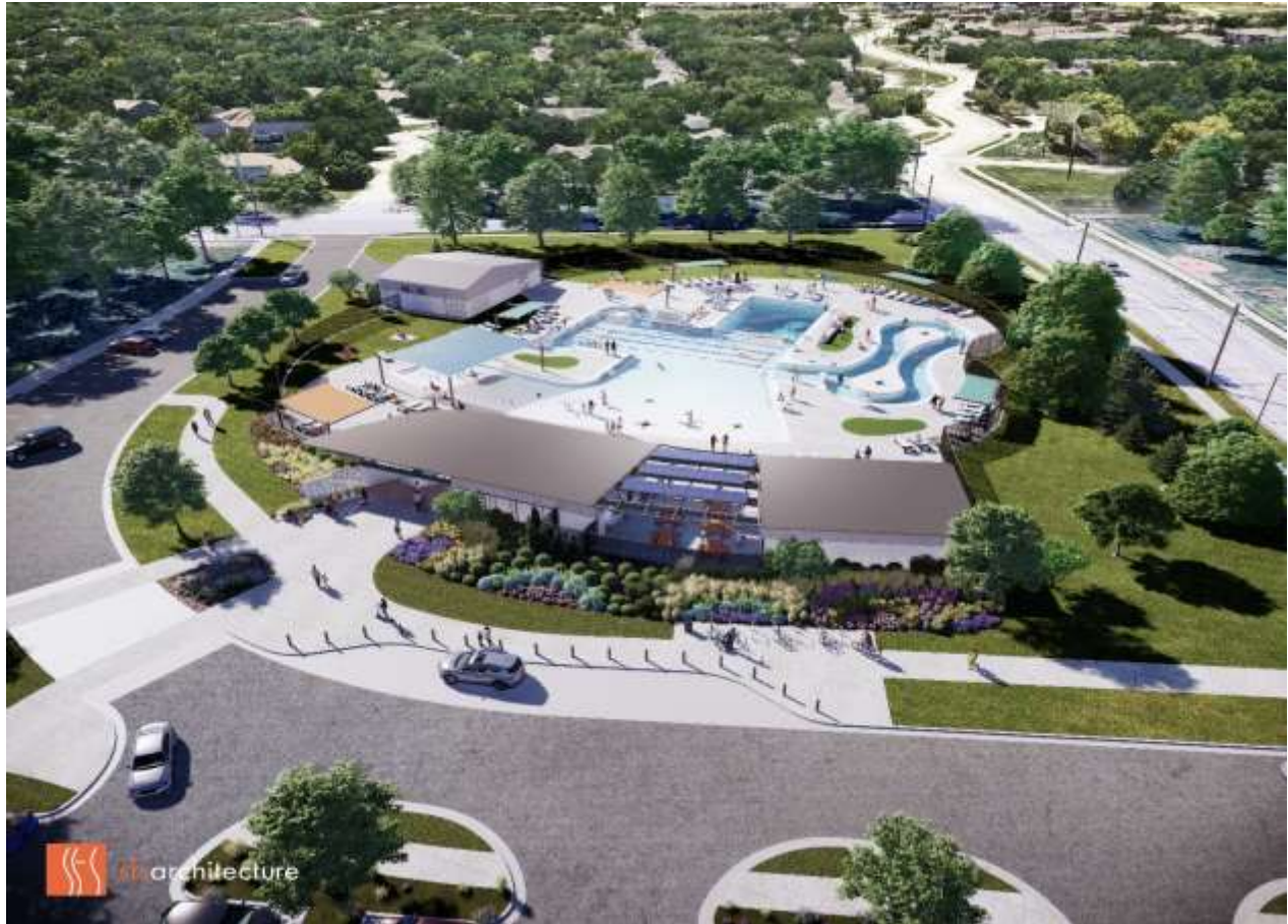
Figure 5 Architect rendering of a Birdseye view from the north